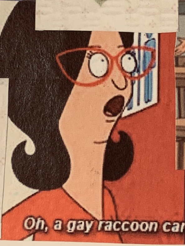
Oh, a gay raccoon can't have babies?

poes very attractivecousin.wordpress.com