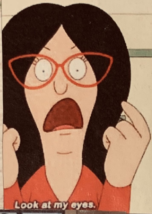
Look at my eyes.