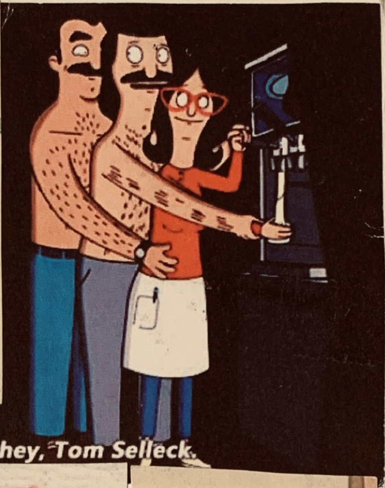
Oh, hey, Tom Selleck.