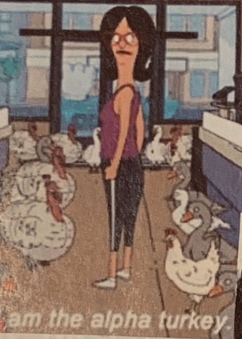
I am the alpha turkey.