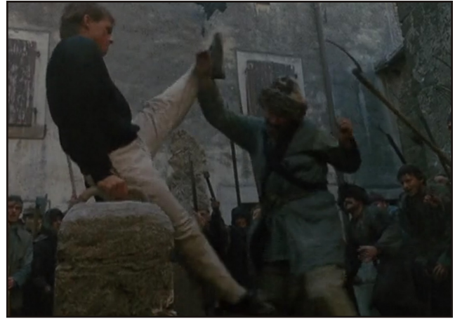
Note the well-placed pommel horse.

much more of a clown. He's small, with a crazy combover, and bears an uncanny resemblance to Mel Brooks. The people of Parmistan are also another wonder of this movie. They all appear to be old and toothless, and, oddly, English seems to be their native language despite the fact that Parmistan is located not far from the Caspian Sea.