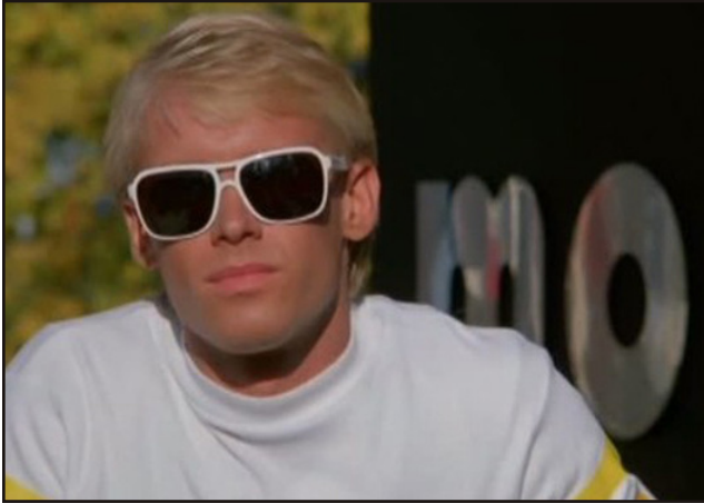
The future's so bright.

surprising, is that the town of Cochran was totally supportive of both the BMX race and Cru. When Duke starts enforcing, or inventing, rules that were never previously mentioned in order to derail Cru's Helltrack appearance the town rallies behind him.