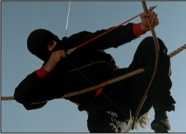
The ninjas are coming for you.