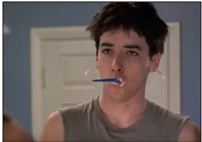
The once-great champion.

But, Charles, who's been going to Greendale High for 7 ½ years and is certainly no dummy has a plan to help Lane win Beth back (or, at the very least, to impress any of the other available girls): Lane must beat Roy in a ski race on the K-12.