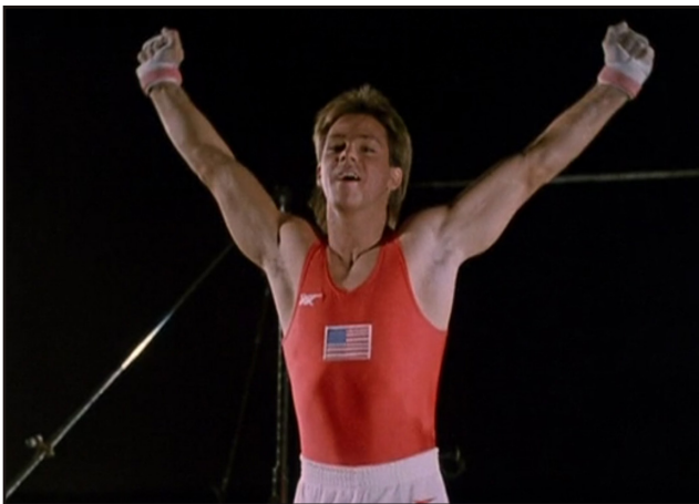
Karate gymnast in training.

Not only is Gymkata the second movie featuring an American Olympic gymnast in this issue of Girls, on Film (in addition to Rad ), but it is also a B-movie with cheesy stunts, bad acting, and karate, one of the preferred methods of self-defense in the 80s. It's hard to take this movie seriously, which actually made it kind of fun to watch. While confusing at times, Gymkata proved to be a classic bad movie that is perfectly set up for parody.