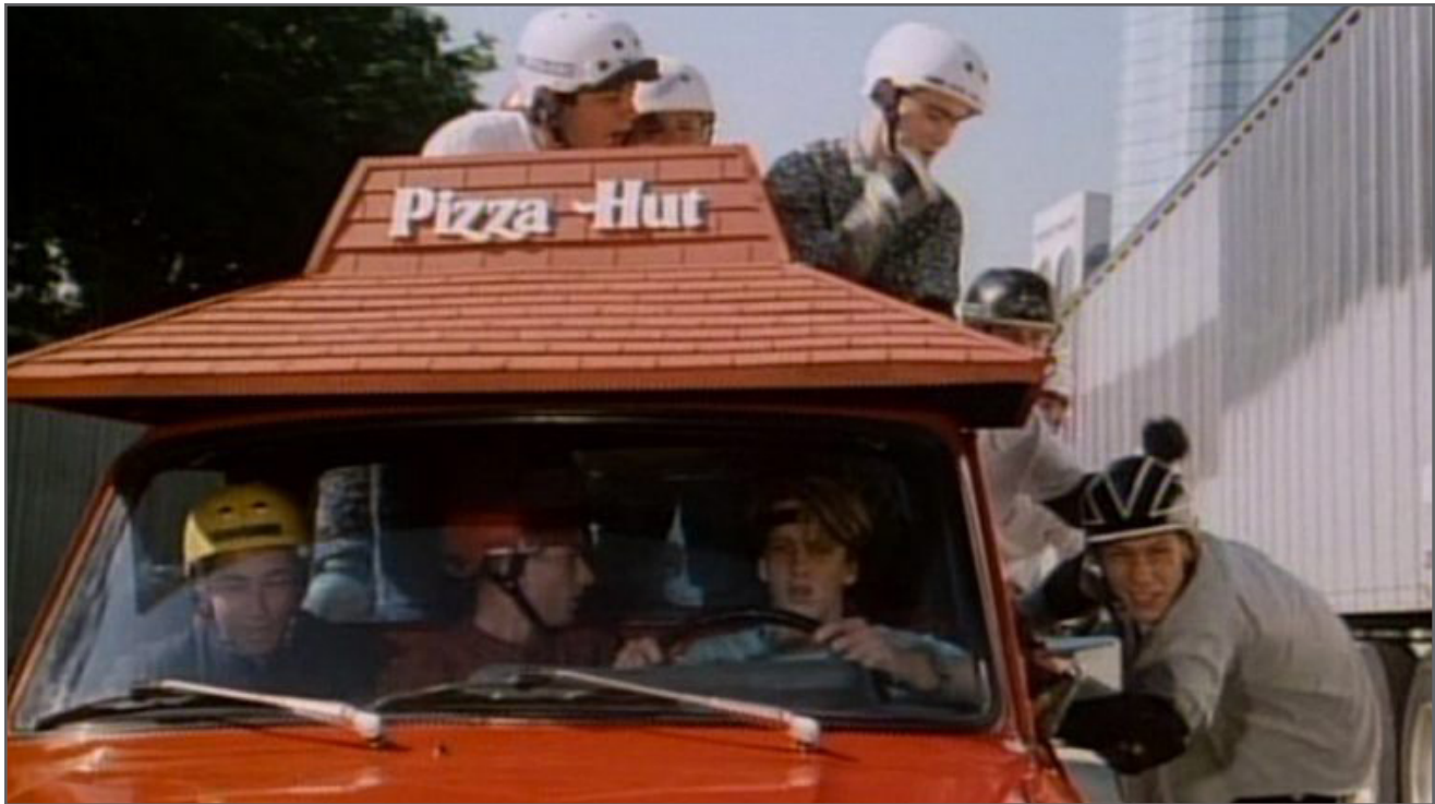
Brian and his pals prepare to take out the Noid.

The movie culminates in a huge chase sequence, and it's all so beautifully-over-the-top. Like William Wallace charging into battle with his men, Brian, now back in skater form, leads his blindly loyal rag tag team of skate friends to Colonel Trac, where Lawndale, the gun-toting arms dealer is taking hostages. The omniscient Detective Lucero is also not far behind. And of course, the good guys prevail. You're welcome, America.