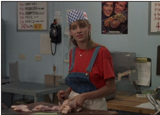
Uma's about to throw that chicken.

Meanwhile, back at home, Johnny's family and friends fall victim to recruiters' bribes and schemes to get them to help convince Johnny to attend their schools. Also, Georgia, aware of the fact that there are girls throwing themselves at Johnny, gets mad at him because she suspects he cheated. While working her job at a butcher shop, they argue and she throws a whole chicken at him. A quick side note, this movie is rife with misogyny, but to Johnny's credit, he never actually cheats on Georgia that we see. He does go to strip clubs, and enjoys having women all up on him, but there is no kissing or sex. So, there's that.