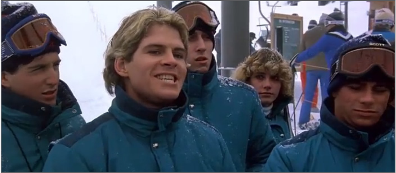
Roy Stalin and his well-oiled machine.

be, in the words of Seinfeld's Jackie Chiles, "the most public of [his] many humiliations yet." Which is why Lane only challenges Roy to the race in a fit of temporary insanity, driven to the brink by a guy who won't stop rubbing in his face that Beth chose him over Lane.