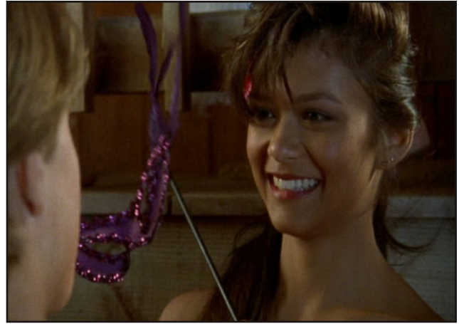
Kiani takes a shine to Rick.

Rick surprises everyone with how well he does in the contest, beating out some of the pros, but because he’s some virtuous soul surfer, he’s not supposed to be