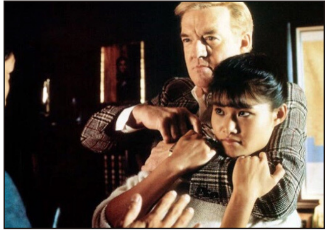
Lawndale, the well-dressed hostage-taker.

The only clue Vinh left behind was the piece of paper with the suspect shipping