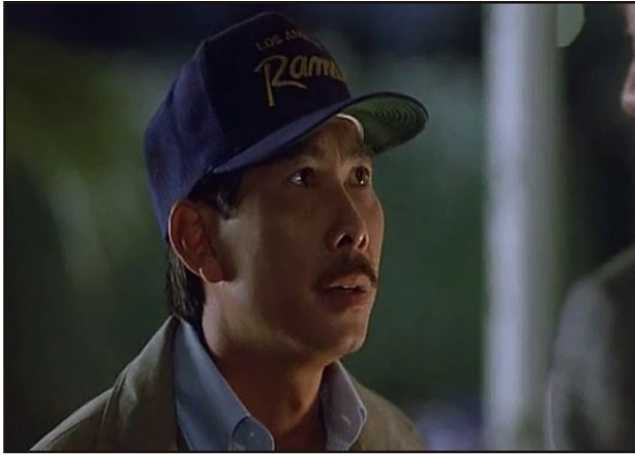
The “just watched the ‘89 NFC game” look.