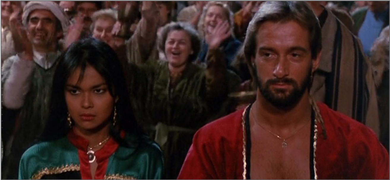
The princess is thrilled about her wedding to Zamir.

anyone trying to avoid an obstacle will be instantly killed. Also, ninjas hunt the contestants as they go along.